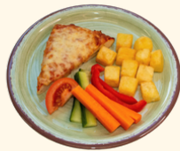
(v) Cheese & Tomato Pizza Wedge (G.D)