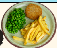
Salmon Fishcake (F.G)