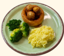
(v) Plant Power Toad in the Hole (G.E.D)