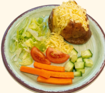
(v) Cheese (D)