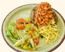
(v) Cheese/Beans (D)