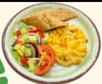
(v)(h) Mac 'n' Cheese (G.D)