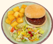
(vg) Plant Power Burger (G)