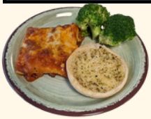
(h) Beef Lasagne (G.D)