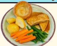
Roast Chicken Fillet Yorkshire Pudding (G.E.D)