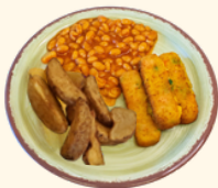
(vg) Garden Vegetable Fingers (G)