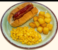
Pork Hot Dog (G.SU.SB)