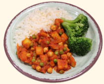
(v)(h) Vegetable Curry