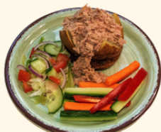
Tuna Mayonnaise